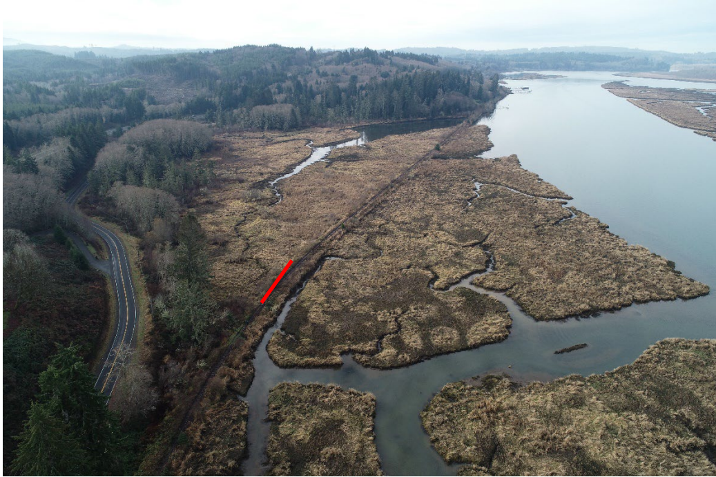
Photo captured from the northeast corner of site, looking to the southwest. Red line indicates approximate location of ~36' single span bridge on east end of site.