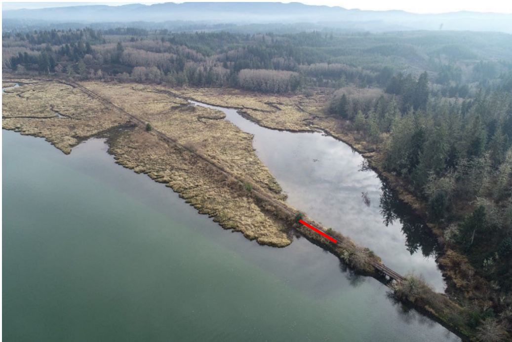
Photo captured from the northwest corner of the site, looking to the southeast. 2019. Red indicates the approximate location of two 30-ft side by side bridges at west end of site.